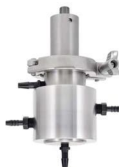
Flocell Assembly with Water Jacket