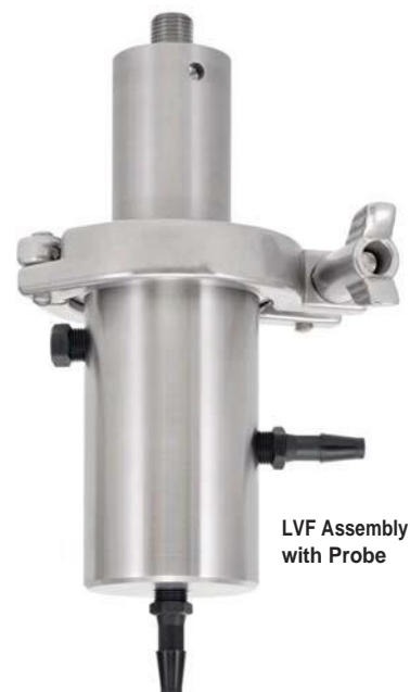
LVF Assembly with Probe

The LVF is recommended for processing sample volumes above 1L. Routine applications include cell lysis, mixing, solubilizing and deagglomerating/dispersing nanoparticles.