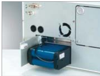
24 V/DC battery