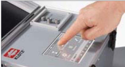
Big user-friendly touch screen

The laser sensor LDS 45/50 is used for contamination control of oils. An LDS 30/30 can be used optionally for the contamination control of diesel and kerosene. Concentrations of up to 200,000 p/ml are possible with it. For the monitoring of cleaning baths the sensor LDS 1/1 is used. The sensor can be operated with a higher flow rate. The LDS sensor features a high reproducibility rate and good resolution. The integrated double piston pump works independently from the input pressure and viscosity. The particle counter Amf can work from lab bottles, from tank systems and from pressure lines.