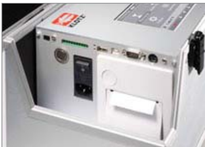
integrated printer and interfaces

Pressure reducing valve and tank for oils.