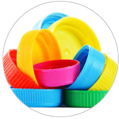
Plastics & Polymers