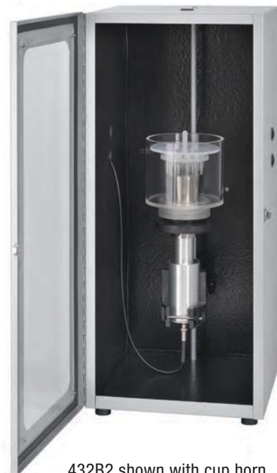
432B2 shown with cup horn (Cup horn sold separately.)

Two ports are located on either side of the enclosure for coolant tubing or a temperature monitoring probe. The interior walls are lined with water resistant acoustical foam and the door has a window so experiments can be visually monitored.