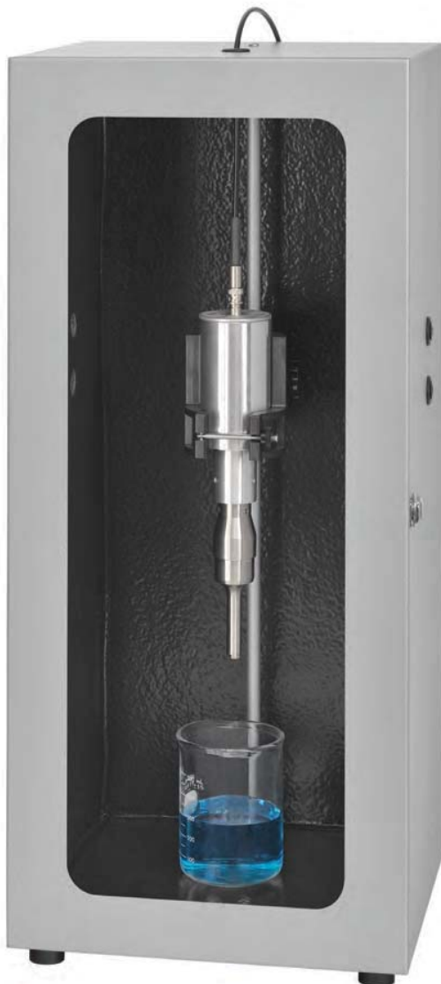
432B2 shown with probe (Probe sold separately.)