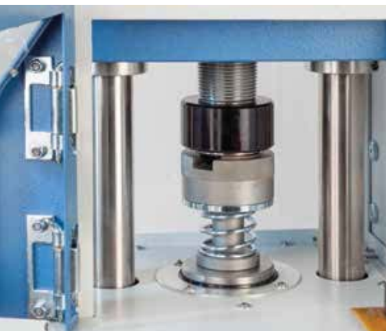
Press tool of TP 20 E

For safety reasons it is not possible to open the input/ output flap during the complete process. The flap is released as soon as the piston is retracted completely. Then the press tool with the pressed pellet can be removed and the machine is ready for the next sample.