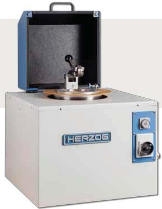
Easily accessible clamping device

After closing the flap the machine is locked during the grinding operation by a safety switch. The grinding vessel is manually removed from the machine and the ground material can be discharged for further processing. The machine is totally enclosed, sound insulated and requires a minimum of operator's time and maintenance. Safety switches automatically deactivate the machine in case of malfunctions during operation.