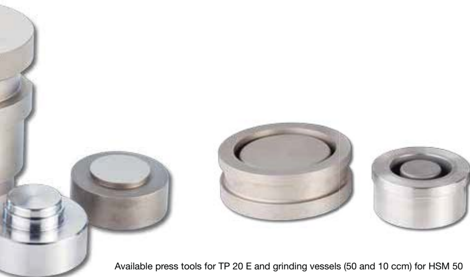
Available press tools for TP 20 E and grinding vessels (50 and 10 ccm) for HSM 50