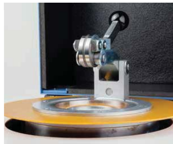
Manual clamping device with and without grinding vessel (50 ccm)