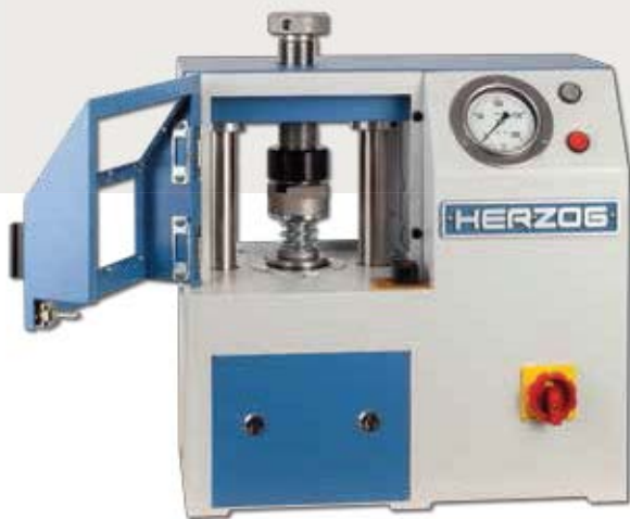
Access to the press tool via safety flap